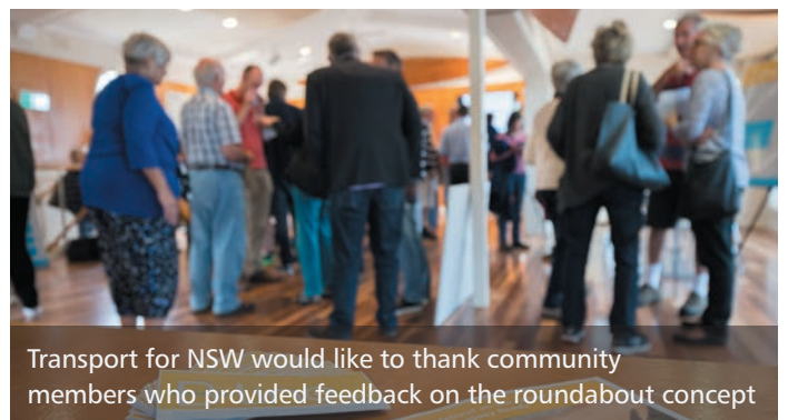
Transport for NSW would like to thank community members who provided feedback on the roundabout concept

Work will also continue along the corridor from Mona Vale to the Sydney CBD to manage traffic congestion, improve reliability of buses and support the new B-Line bus services.