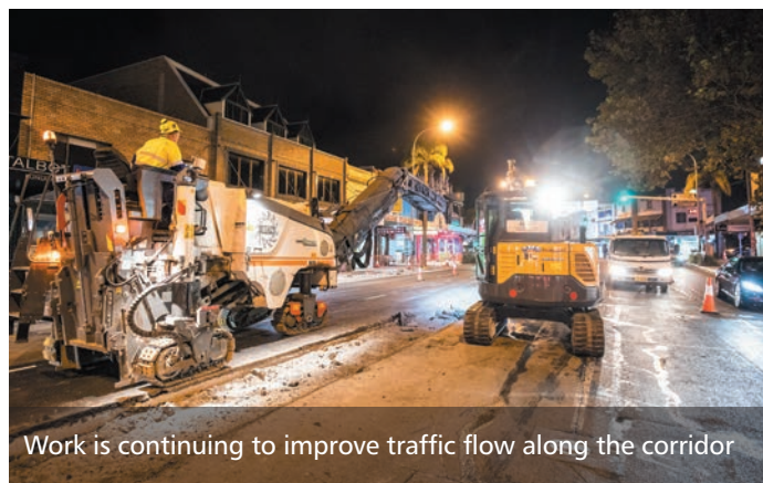
Work is continuing to improve traffic flow along the corridor

Coupled with the full completion of existing roadwork improvements, we expect further travel time benefits for customers to be realised by early 2019.